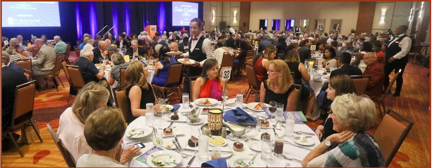
Guests enjoyed dinner before the evening's big event—the live auction.