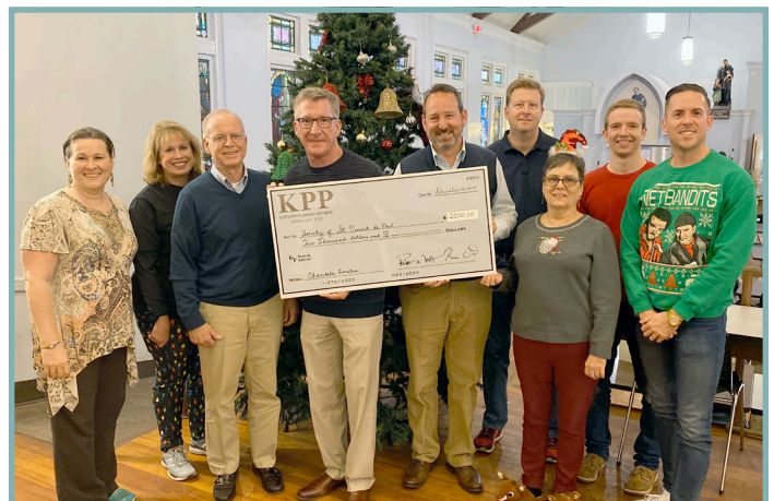
On December 11, Kentucky Planning Partners brought KFC for dinner at the Open Hand Kitchen and presented St. Vincent de Paul Louisville with a $2,000 donation.