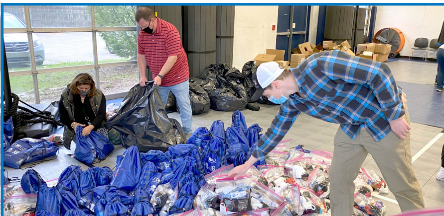
Volunteers assembled about 1,000 hygiene kits that will be distributed to those in need around campus.