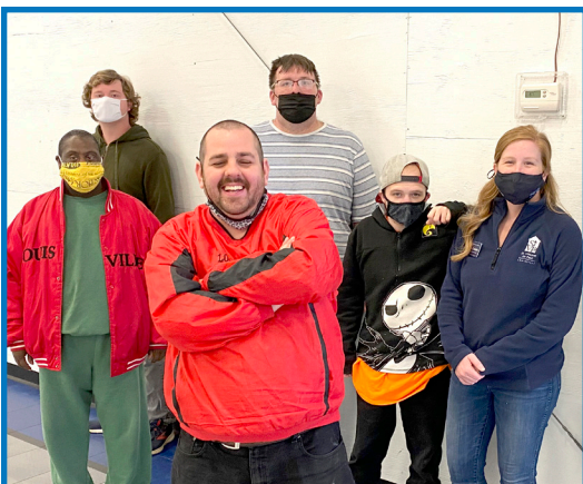
A group from Harbor House stopped by to help assemble hygiene kits.