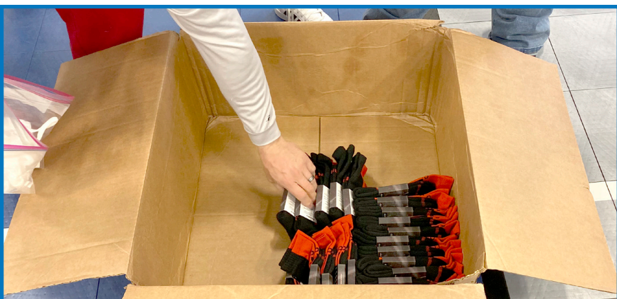
Muhammad Ali Special Edition Socks donated by Bombas were included in the kits. Bombas has donated hundreds of pairs of socks to us over the years.