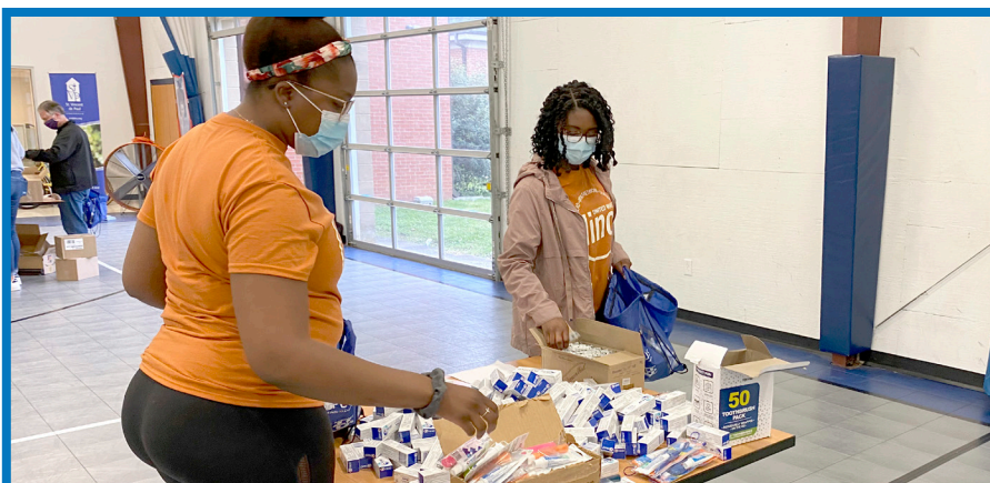
Volunteers visited stations stacked with items like deodorant and toothpaste and filled the backpacks and storage bags.

For Mayor's Give A Day in April, St. Vincent de Paul Louisville hosted its first volunteer event in months. About 50 volunteers showed up on a Saturday morning and assembled 1,000 hygiene kits that will be handed out to clients on campus and to those visiting the Open Hand Kitchen.