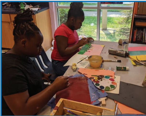
Afternoon painting activity helps the kids reflect on their family and develop creative skills.