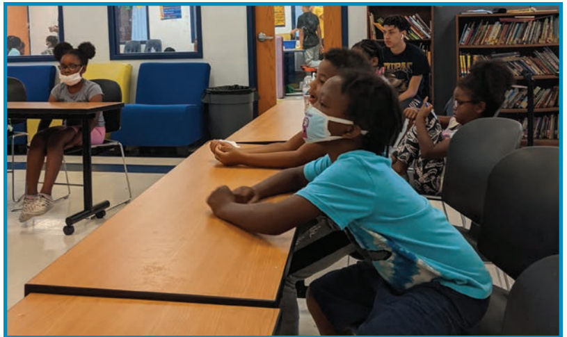
Kids listening intently on how chess pieces can move on the board, preparing them to play chess later in the camp.