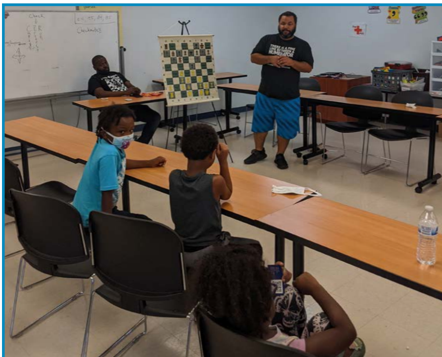
Camp counselors teach the kids how to be strategic in their chess moves and in their lives.