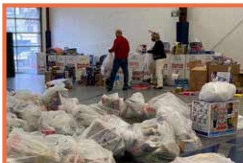
In 2020, volunteers shopped for children of different ages to prepare gift bags for our families.

Each year our "Gifts from the Heart" program asks for donations of new gifts that will be organized into a mini-mall in the Family Success Center. Last year Covid changed the way we did things, but parents still expressed joy and gratitude as they received their donated gifts. This year's plans are still under discussion as we consider the best way to provide the Santa experience to our families. We'll share final plans with you in the November issue of The Good Samaritan.