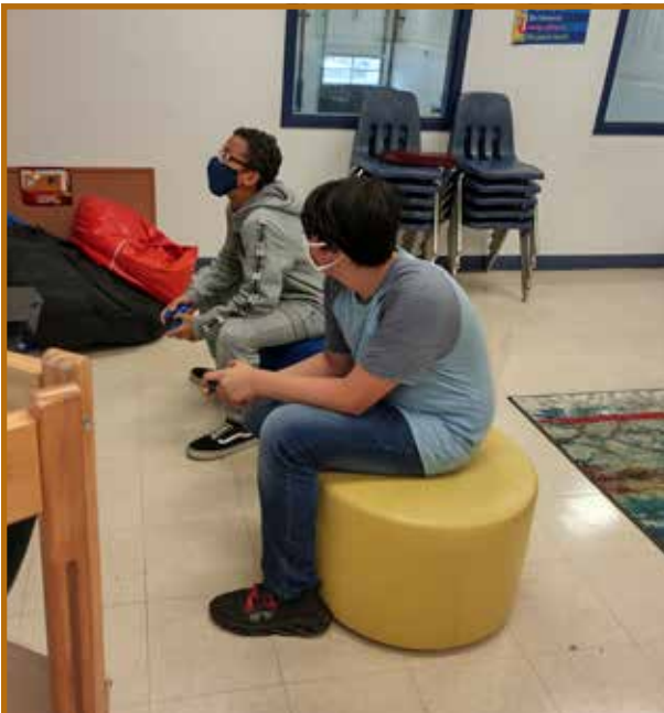
They have access to electronic games.