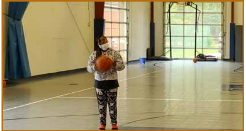
Young people have an opportunity to learn and play at the SVDP after-school program.

Our thanks to those who created the opportunity for SVDP to work with these children. Your support means so much to the staff, children, and families touched by this program.