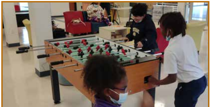
Children of all school ages have the chance to learn, grow, and play.