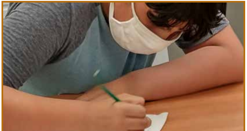
There is time for study with tutors and support from the staff.