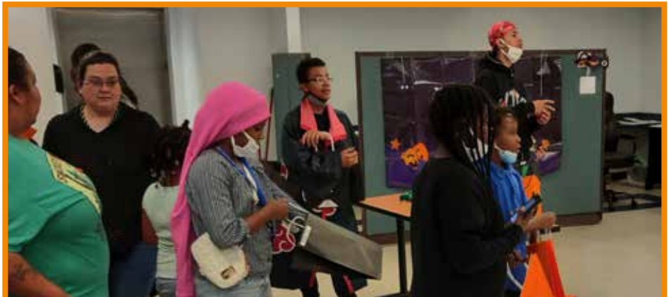
Parents joined in the fun as everyone learned the rules of each game.