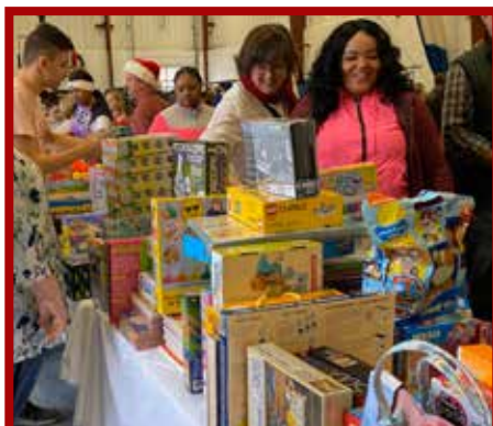
This year, we hope to return to a more satisfying shopping experience.