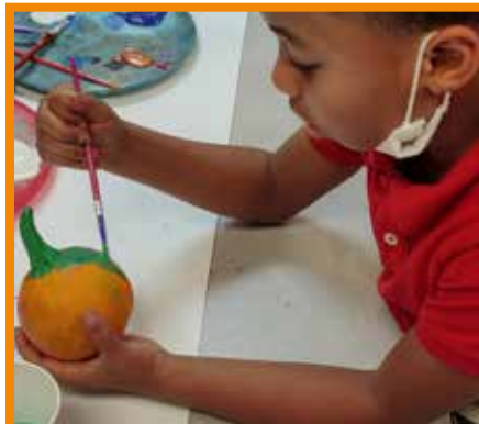
The festivities began with pumpkin painting.

Some children dressed in Halloween costumes. Some enjoyed the evening in their regular clothes, but all the children found time for fun at the St. Vincent de Paul Louisville Children's Halloween party.