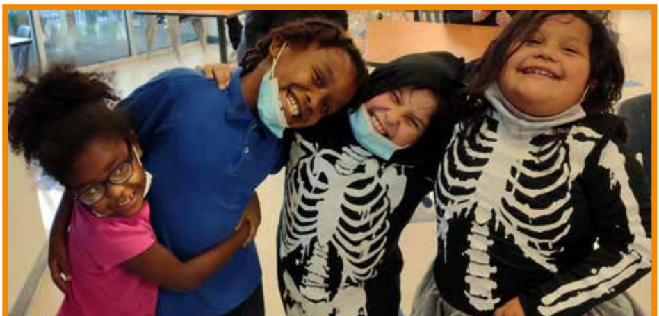
Friends make a party fun.