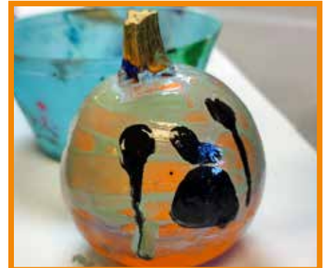
The pumpkins dried while the children played games.