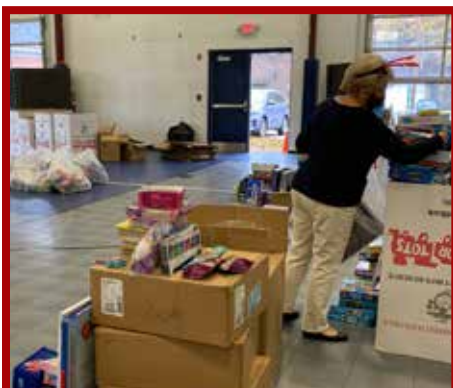
In 2020, gifts were prepackaged for parents.