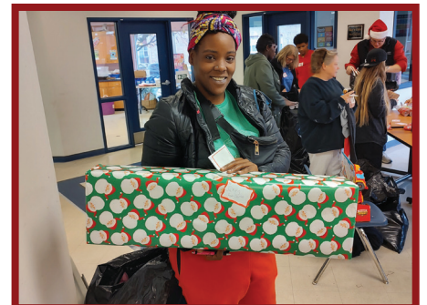
Santa Shop brought joy to all who gave and who received this Christmas season.